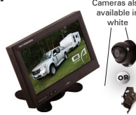
OA7MCS 2 Way Reverse Camera System