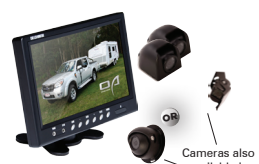
OA485CS 4 Way Reverse Camera System