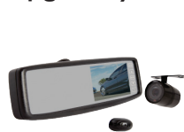
OA43RMPK 4.3" Screen • Bluetooth • Camera